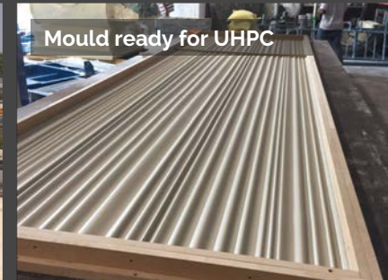
Mould ready for UHPC